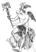
Mercury Roman messenger god Mercurio