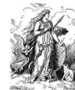
Frigg Wife of Odin, mother of Tyr and Thor