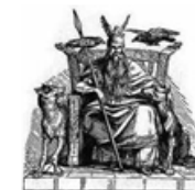
Odin Father of the Norse gods