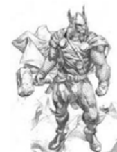
Thor Norse god of thunder