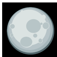
the moon la luna