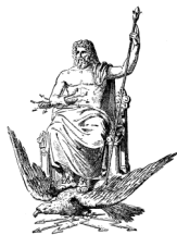
Jupiter (Jove) King of the Roman gods Júpiter