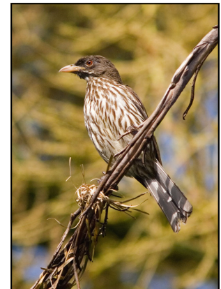
palmchat the national bird