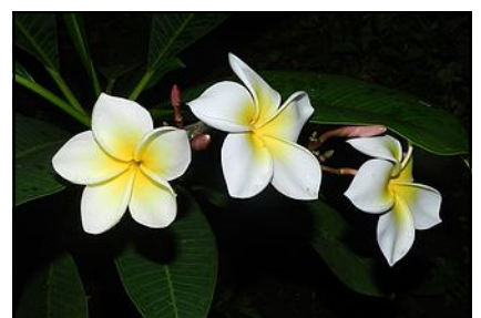
sacuanjoche the national flower