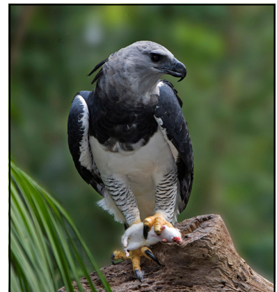
harpy eagle the national bird